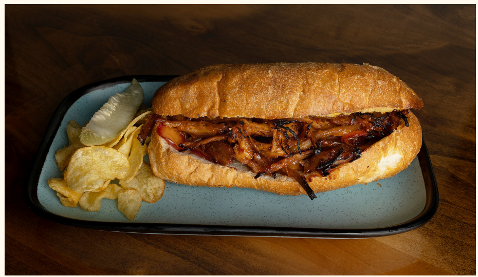
PACIFIC BBQ PULLED PORK