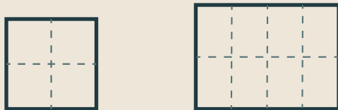
HALF Bonfire 8" x 8"

A deep-dish style pizza, baked on our scratch raised dough infused with chopped garlic and butter, featuring a crispy outer crust of caramelized Wisconsin "Brick" cheese.