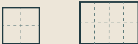
HALF Bonfire 8" x 8"

A deep-dish style pizza, baked on our scratch raised dough infused with chopped garlic and butter, featuring a crispy outer crust of caramelized Wisconsin "Brick" cheese.